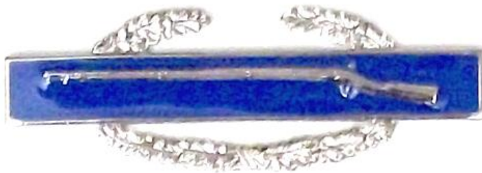
Combat Infantryman Badge